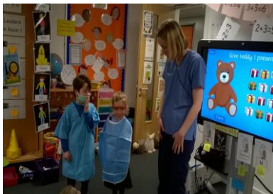
A visit from the dentist (and parent) to P.1 children

The experiences and outcomes reflect a holistic approach to the promotion of health and wellbeing for all children and are consistent with the United Nations Convention on the Rights of the Child. Children take part in structured lessons and benefit from other activities outwith the classroom such as health related performances, health weeks, sports taster sessions and outdoor activity. Each child takes part in a minimum of 2 hours weekly quality Physical Education. This will take place both indoors and outdoors and includes links with the community. It would be helpful if your child kept an old pair of trainers and a pair of tracksuit bottoms in school for wearing outdoors.