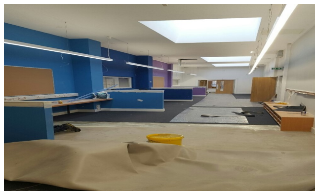
A new classroom