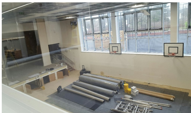
Our school hall

Looking up to the 'bridge'- original building on the right, new building on the left.