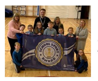
The Sports Council worked hard alongside staff and our Active Schools Co-ordinator to achieve the Sports Scotland Gold Award for our achievements in sports ~ a very proud school!