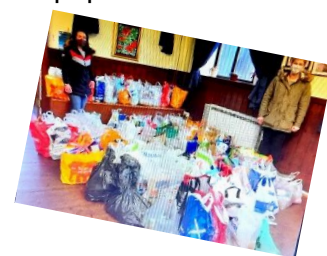
Supporting Rutherglen Foodbank with the support of our Parent Council

~ links with local businesses such as Rain or Shine South Lanarkshire to help support the local community in need.