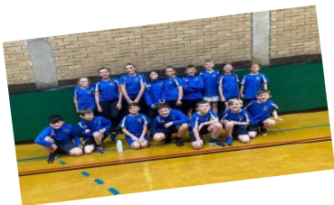
P6 & 7 pupils celebrating a win at the SLC Sportshall Athletics competition.