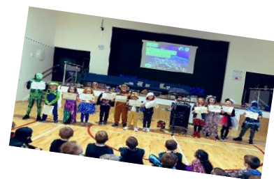
Learning about Cop26 then sharing our learning....