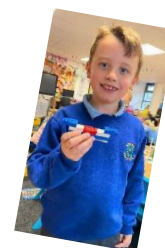
Making symmetrical patterns

Problem solving strategies are an integral part of learning at each stage.