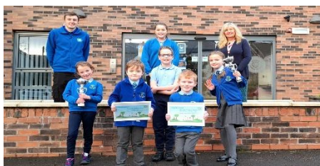
Proud 'Beat the Street' winners in both average and overall points, 2021.