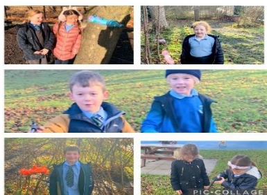
Some of our younger pupils taking part in a local litter pick